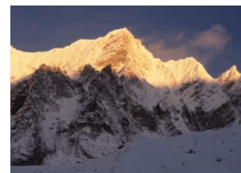
The Grandes Mirailles group from Cervinia

Christmas cards Six of each design per pack without Bible verse