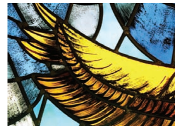
Part of the chancel window at St. Bernard's Church

Blank cards (notelets) Photographs by David Healey ARPS Six of each design per pack without Bible verse