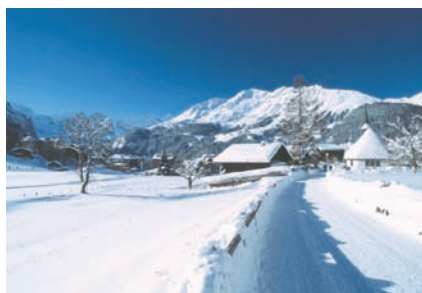
The path to St. Bernard's Church

Christmas cards Photographs by David Healey ARPS Twelve per pack Available with or without Bible verse New for 2008