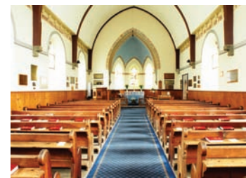
The interior of St. Peter's Church

Blank cards (notelets) Photographs by David Healey ARPS Six of each design per pack without Bible verse