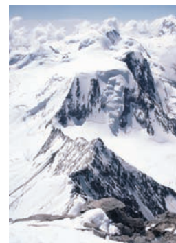
The Alphubel from Täschhorn